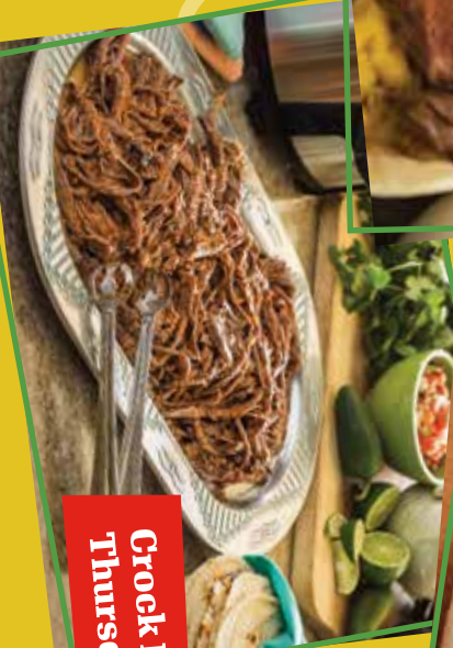
Crock Pot Thursday