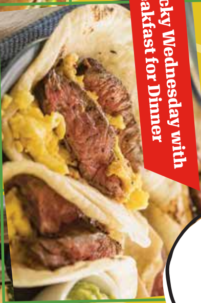
Wacky Wednesday with Breakfast for Dinner